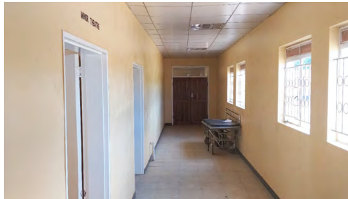
A hallway leads to the surgery room.