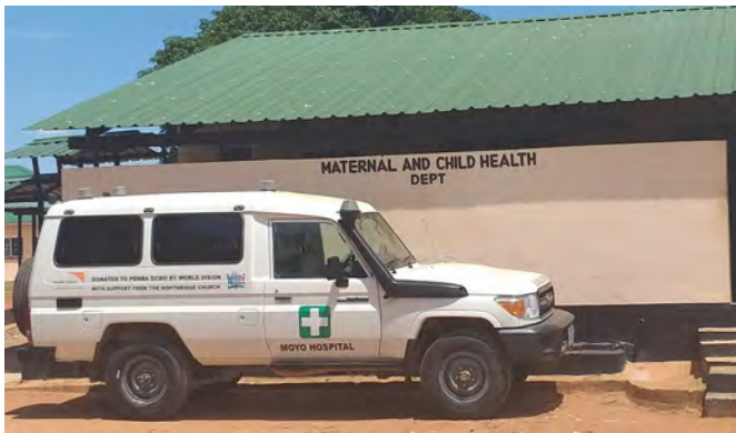
The ambulance, provided by the project, parked alongside the maternal and child health building.