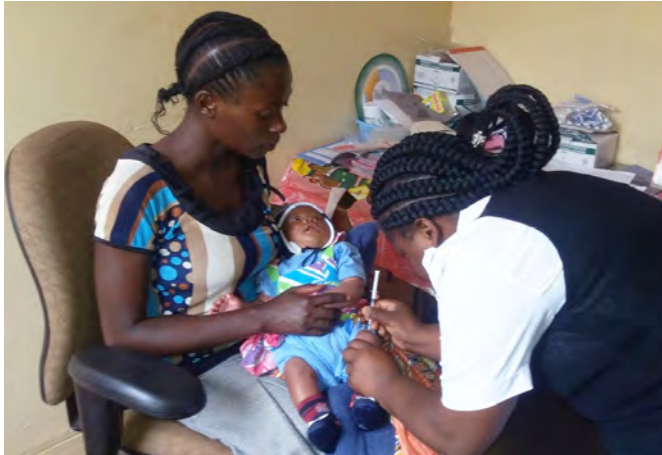
An infant is immunized at Moyo Hospital.