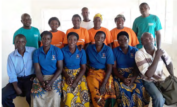
Members of Safe Motherhood Action Groups and maternal infant and young child nutrition groups are among those who help teach the importance of maternal and child health and nutrition at the clinic and households.