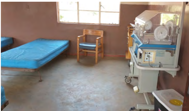
The postnatal maternity ward is equipped and ready for patients.