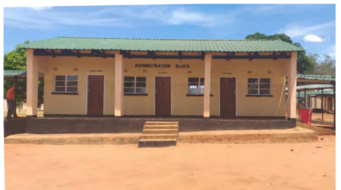
The hospital grounds include a designated administration building.