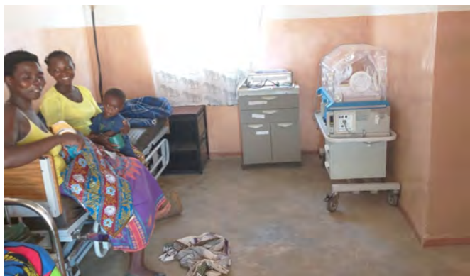
Mothers and infants wait in the postnatal maternity ward.