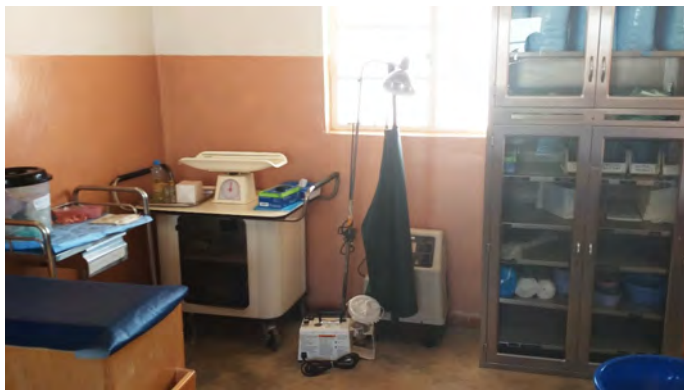
The maternity ward is stocked with supplies.