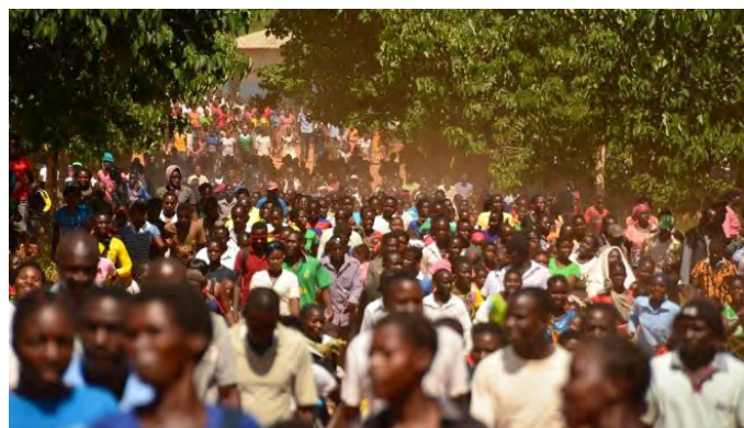
The Moyo Hospital handover celebration attracts hundreds of local residents.