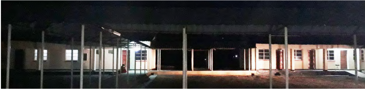
The Kanchomba Clinic photographed at night, fully lit.