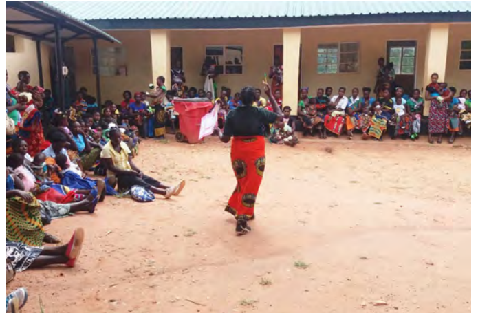
A Safe Motherhood Action Group member teaches mothers about the importance of immunization.