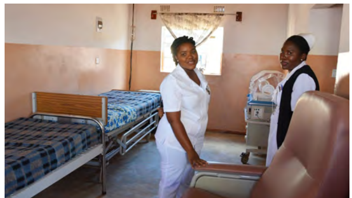
Midwife nurses conversing in the maternity ward.