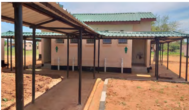
A block of bathrooms is made available for both medical staff and patients.