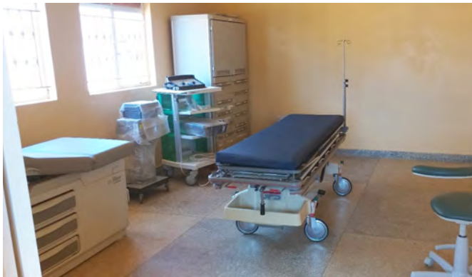
The surgery room is ready for service.