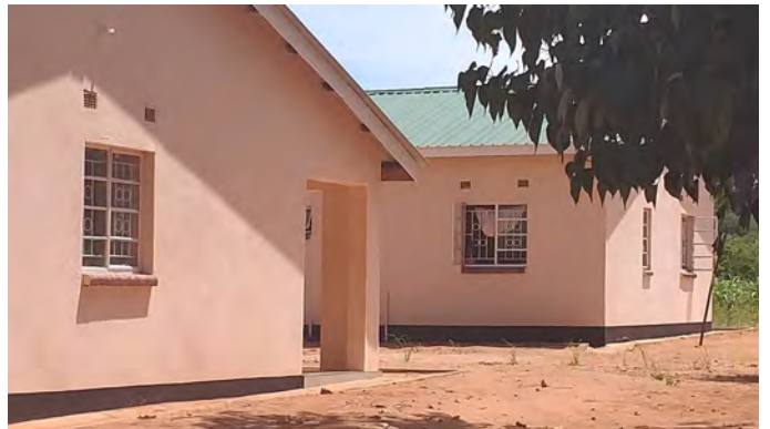
Medical staff reside in houses built on the hospital grounds.