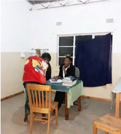
With 24/7 electrical power, a patient is provided medical attention at a nighttime appointment.