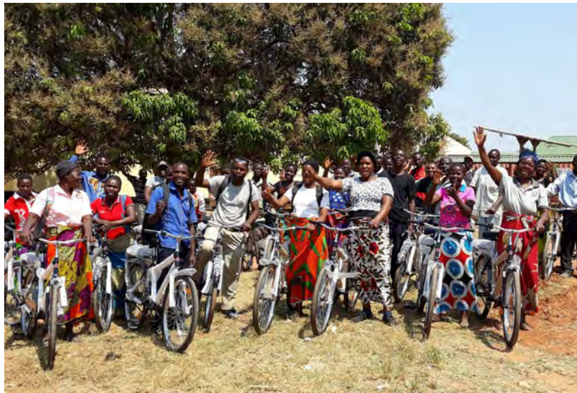
Community volunteers are presented with bicycles to ease their work, making it possible to serve more people.

Thank you, Northridge Church. We are grateful for your prayers and your dedication to children, mothers, and families in Moyo and Hamaundu. May God bless you.