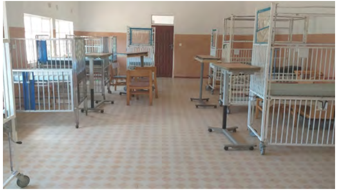
The children's ward is complete with beds that are appropriate for children.