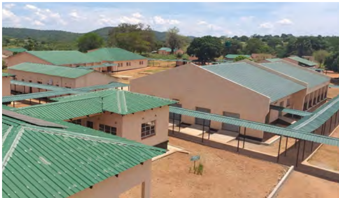
Moyo Hospital is complete with covered walkways.